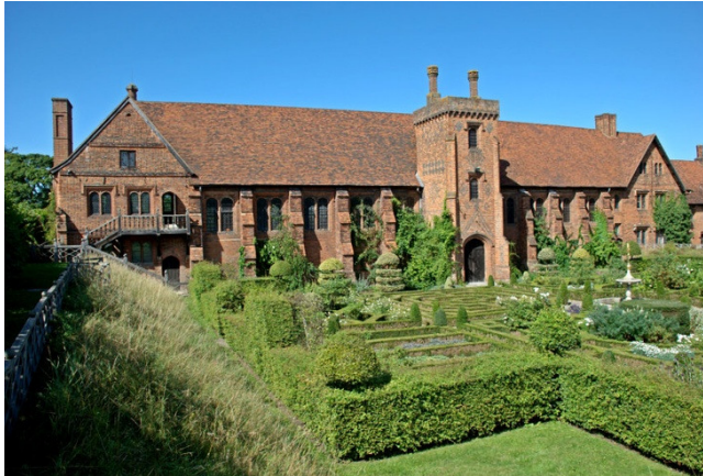
The Old Palace at Hatfield House