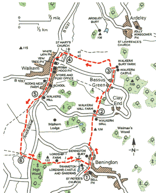
Walking the Beane Valley