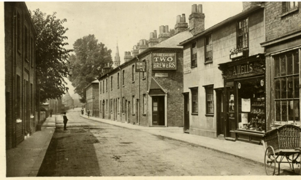
Port Vale between 1910 and 1930

Her talk will explain how Bengeo developed after 1800. It will be based on her research which underpinned the three very popular exhibitions about Bengeo held in 2014 and 2015.