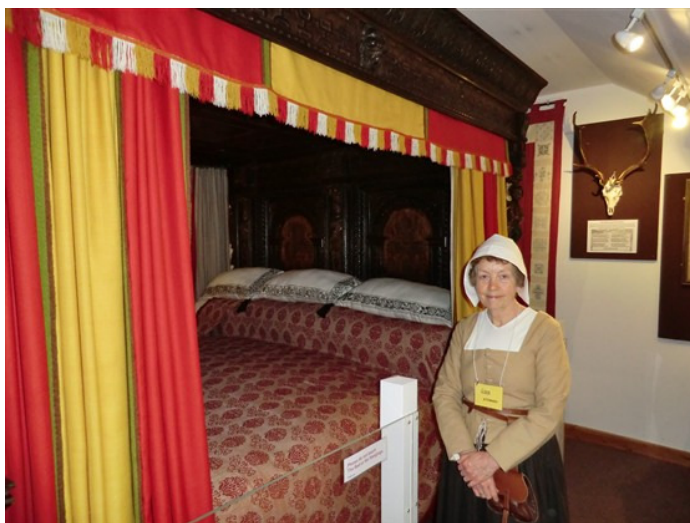
The Great Bed in the Museum, 2013

He will tell us how the loan was achieved and how it was beneficial to the people of Ware.