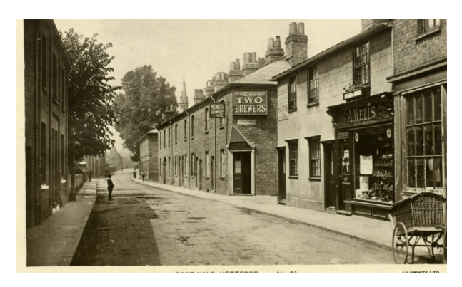
Port Vale between 1910 and 1930

Her talk will explain how Bengeo developed after 1800. It will be based on her research which underpinned the three very popular exhibitions about Bengeo held in 2014 and 2015.